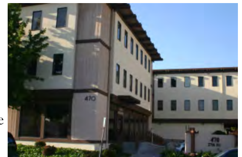
Alameda County Family Justice Center - 470 27th St., Oakland.

Core services provided on-site include: crisis intervention; law enforcement investigation and prosecution of offenders; temporary restraining orders; victim/witness support and advocacy; case management; individual and family counseling; support groups; medical clinics; emergency and transitional housing; childcare; transportation; faith-based services; multilingual capabilities; and many others.