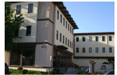
Alameda County Family Justice Center

Core services provided on-site include: crisis intervention; law enforcement investigation and prosecution of offenders; temporary restraining orders; victim/witness support and advocacy; case management; individual and family counseling; support groups; medical clinics; emergency and transitional housing; childcare; transportation; faith-based services; multilingual capabilities; and many others.